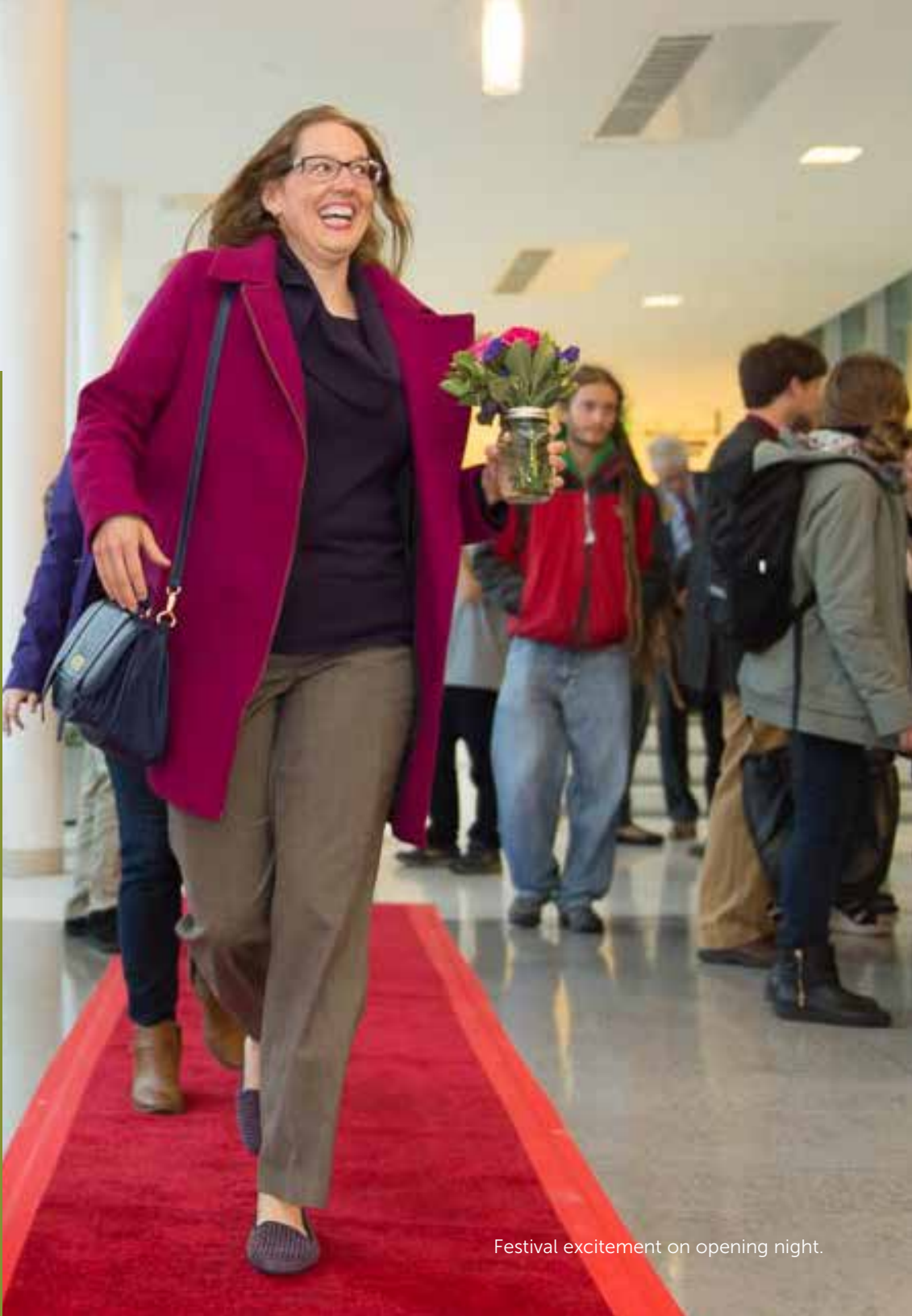
Festival excitement on opening night.