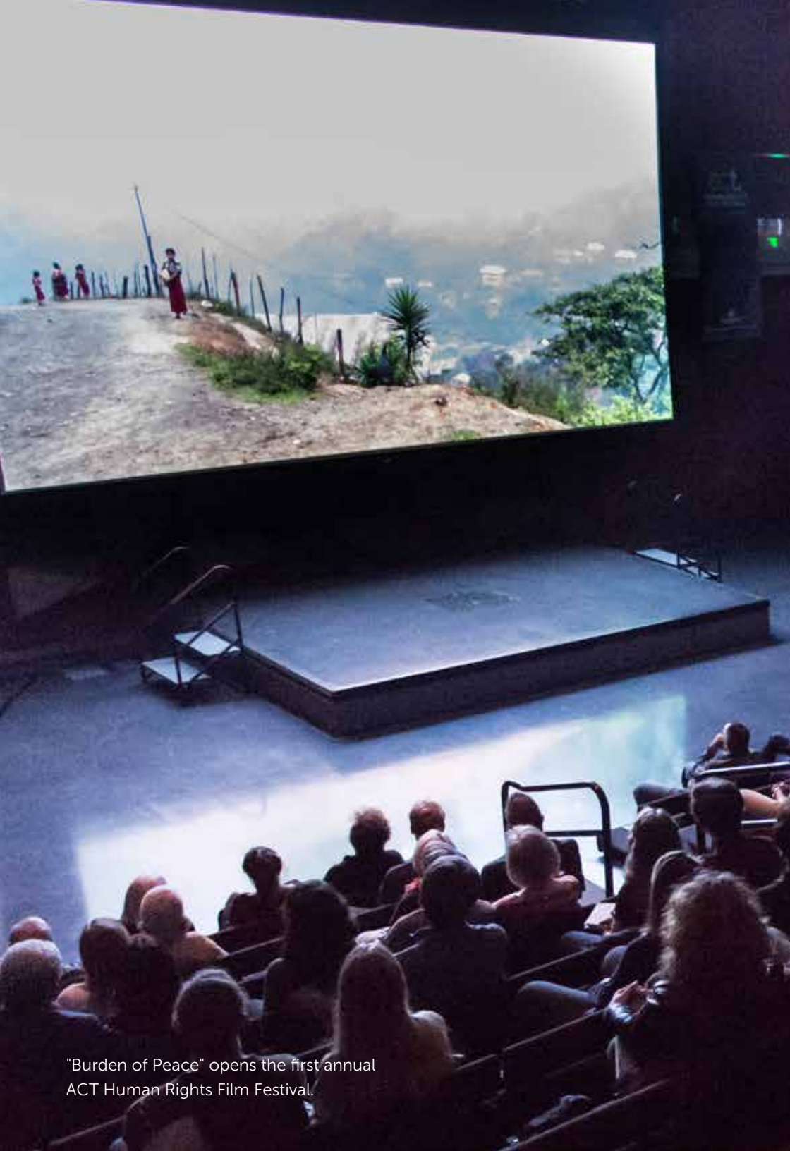
"Burden of Peace" opens the first annual ACT Human Rights Film Festival.